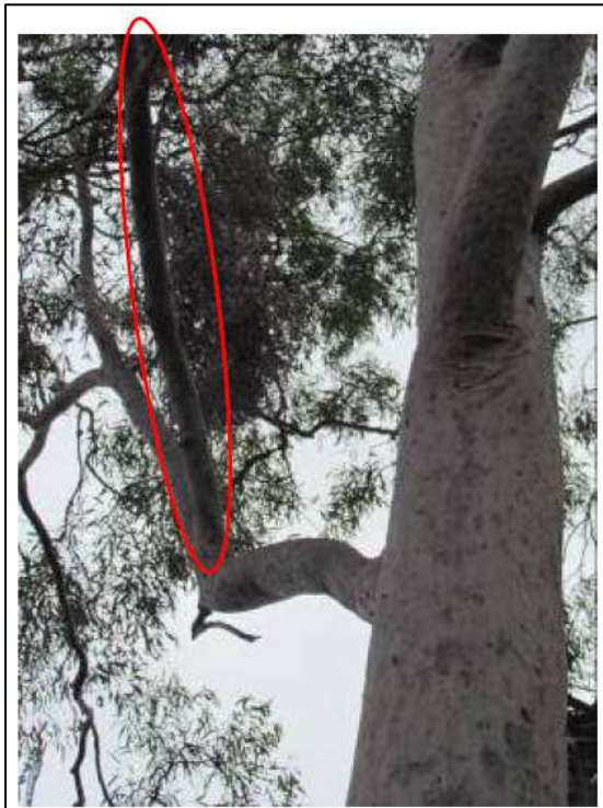
looking west up into the eastern, lower canopy of T3, showing limb targeted for removal.