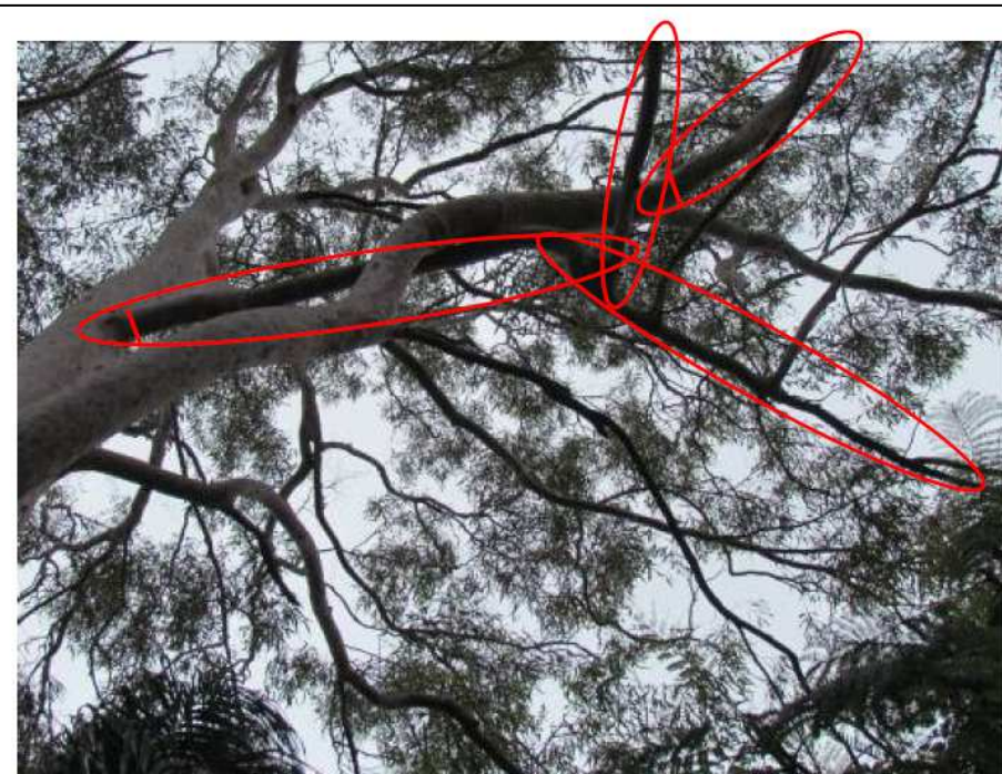
looking west up into the eastern, lower canopy of T3, showing limbs targeted for removal. The red circles surround the branches to be removed, while the red lines indicate the approximate locations of the final cuts to be made.