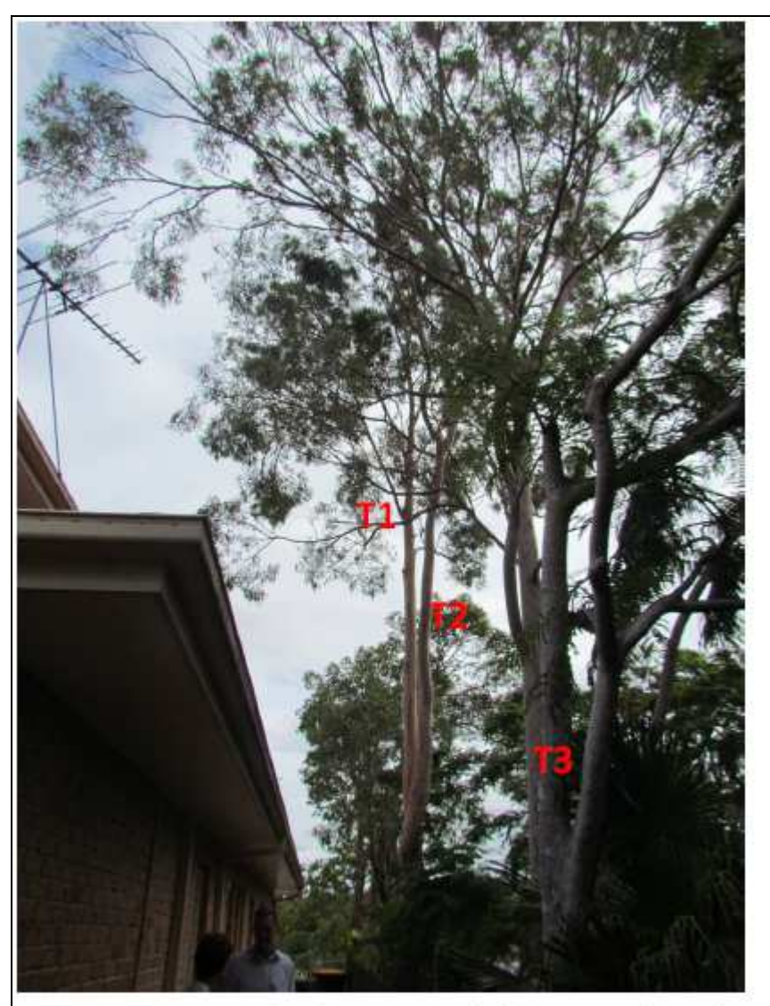
looking south from within the applicant's property, showing T1, T2 &T3 overhanging the applicant's dwelling.