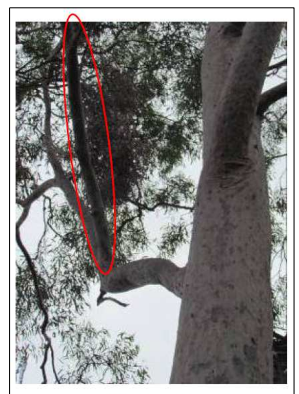
looking west up into the eastern, lower canopy of T3, showing limb targeted for removal.